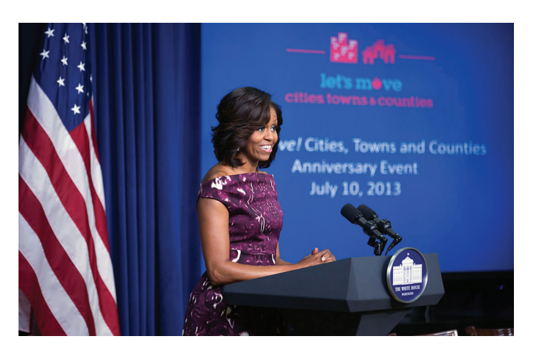
First Lady Michelle Obama encourages public health officials to use IHME's research for US counties.

IHME is conducting a King County, Washington, burden of disease study, using all available data to provide an in-depth look at health outcomes across different age groups, genders, and communities. We are collaborating with Public Health — Seattle & King County to ensure that the results are widely disseminated, understood, and used by local decision-makers. To foster community engagement and ensure accessibility of the data, IHME will make the study's findings publicly available in an easy-to-use data visualization tool.